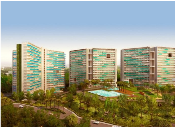
1- Artist's rendering of the The Residences at Commonwealth by Century