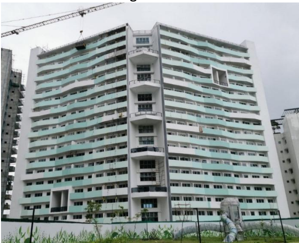
2- Roxas West is the fifth residential tower to be completed at the Residences at Commonwealth in Quezon City