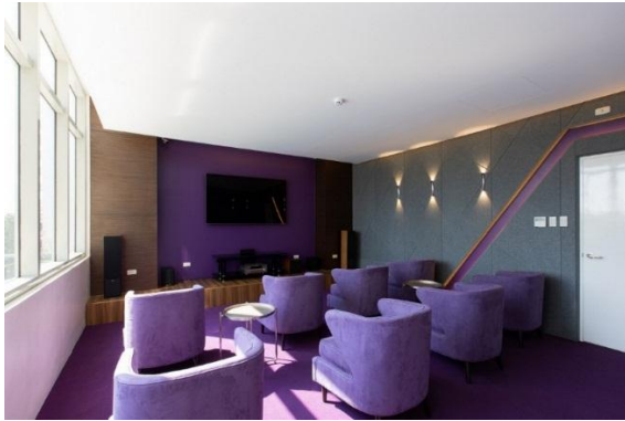
7- Movie Room