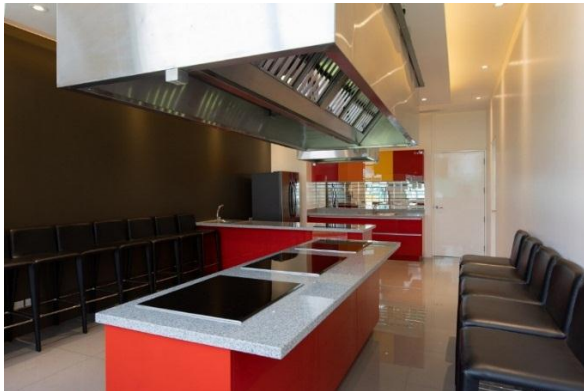
11- Show Kitchen