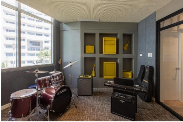
9- Rock & Roll Studio

21 ST FLOOR PACIFIC STAR BLDG., SEN. GIL PUYAT AVENUE CORNER MAKATI AVENUE, MAKATI CITY, PHILIPPINES 1200 TELEPHONE: (632) 793-5500 TO 04 FAX: (632) 811-5588