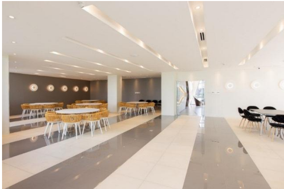
8- Multipurpose Room