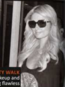
CELEBRITY WALK Paris en route to makeup and hair, already looking flawless