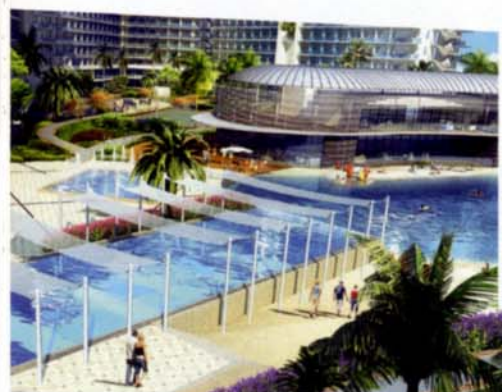
Above A view of Azure's lap pool and beach clubhouse; Below A closer look at the Azure man-made beach

"WHAT I LOVE MOST ABOUT THE PHILIPPINES IS THE PEOPLE. FILIPINOS ARE SO SWEET, WELCOMING AND GENUINELY GOOD. I LOOK FORWARD TO COMING BACK AGAIN AND AGAIN."