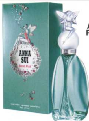
Anna Sui's Fragrances

'Secret Wish' eau de toilette. An enchanting woodland fairy perched atop the fragrance bottle beckons you to reveal your innermost desires, and let the magic happen.